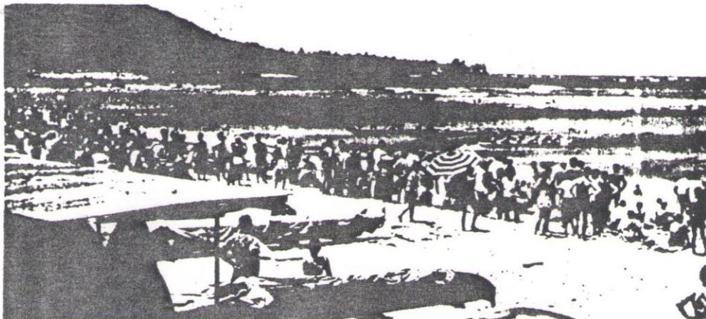
Huge crowd watches start of Blue Ribbon 6 Men Senior event.

Boys' Freshman Six, 1 mile—1. Waikiki Surf, 2. Hui Nalu, 3. Outrigger, 4. Hale Auau. Time: 10:49.0.