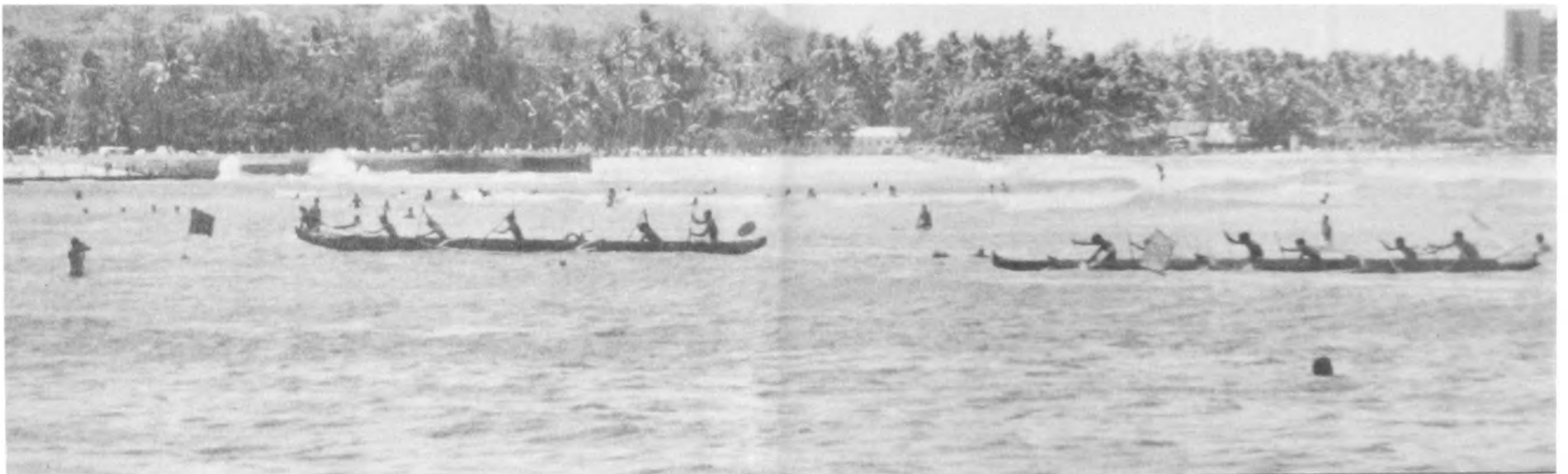
The 12's minus number 4 (in bottom of canoe) finish first at Waikiki.