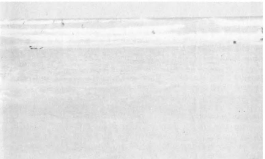
The 16's come in.