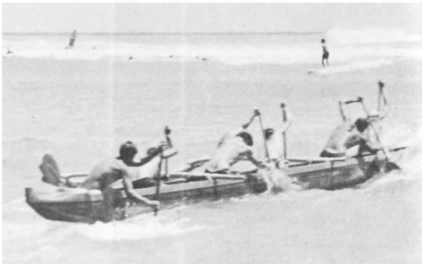
The 16's go out.