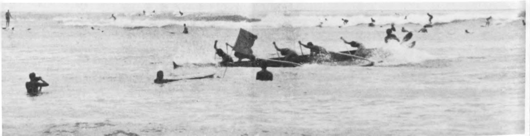
The 18's finish.