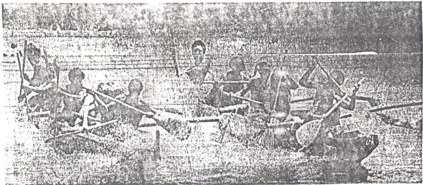
BATTLING NECK TO NECK —Healani's crew (left) and Koolau wage a torrid neck-to-neck battle in yesterday's mixed open race in the Macfarlane Regatta at Waikiki Beach.