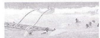
Two women's crews tread water after their canoes were swamped.