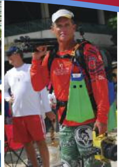
Photographer Twain Newhart is ready for action.