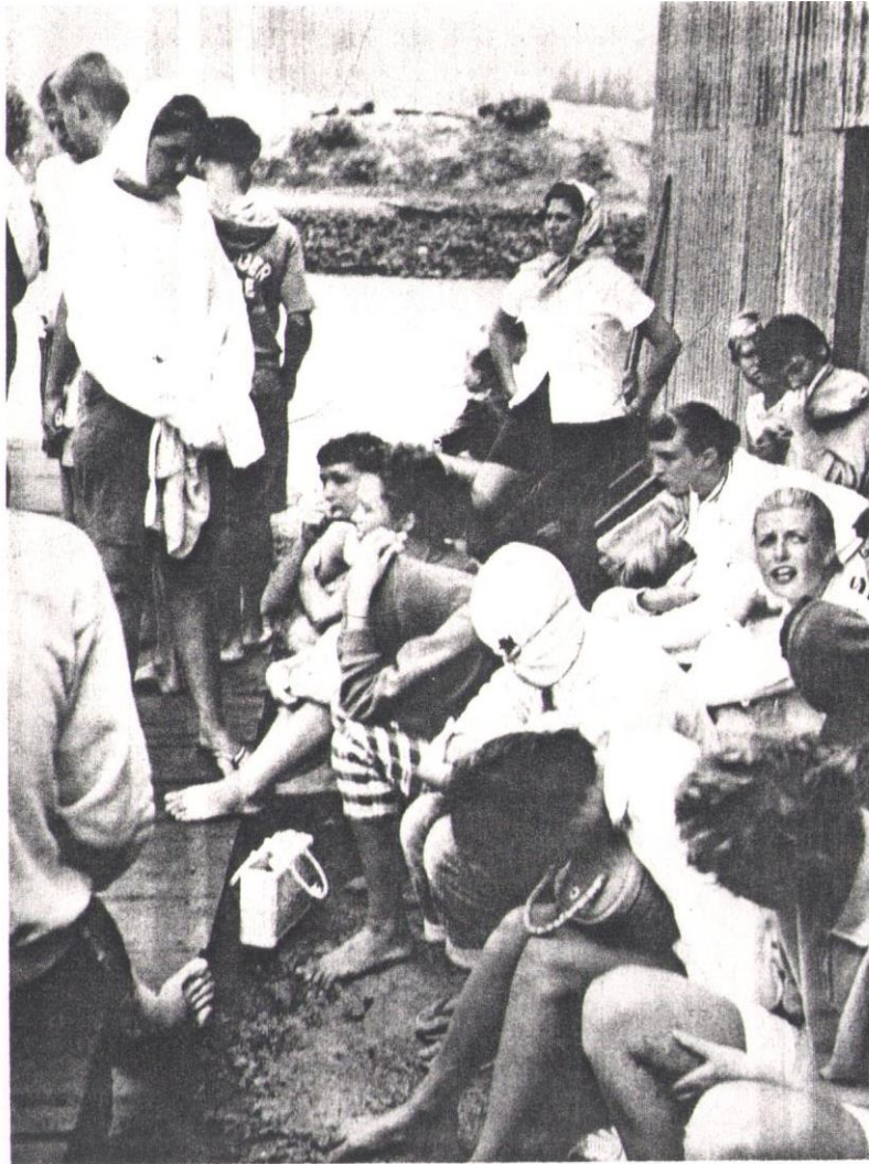
The OCC Canoe Team at Kauai during the Territorial Races.