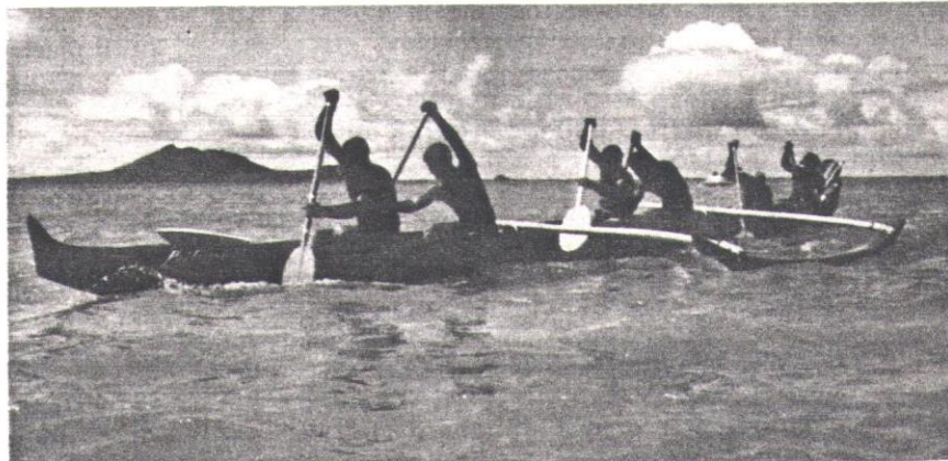
The seniors warm up for their race.