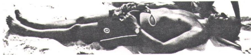
A spectator sport?