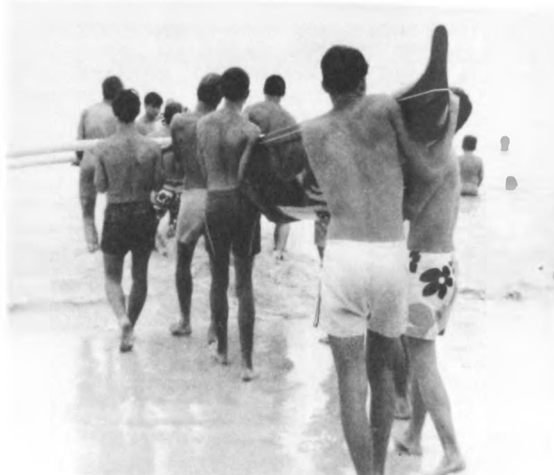
The PAOA goes for her first race.