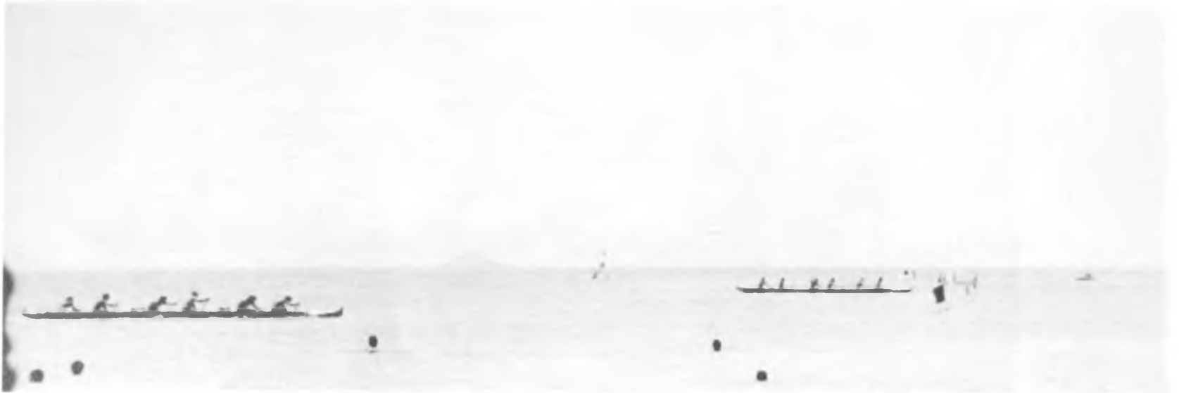
The PAOA's second win of the regatta is a substantial one with the 18's.