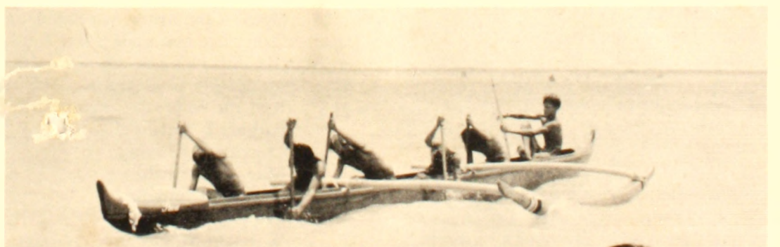
Boys' 13 and Under finish first on Kam Day.