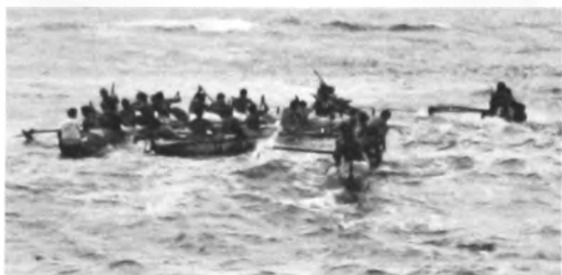
The Kauai Race start