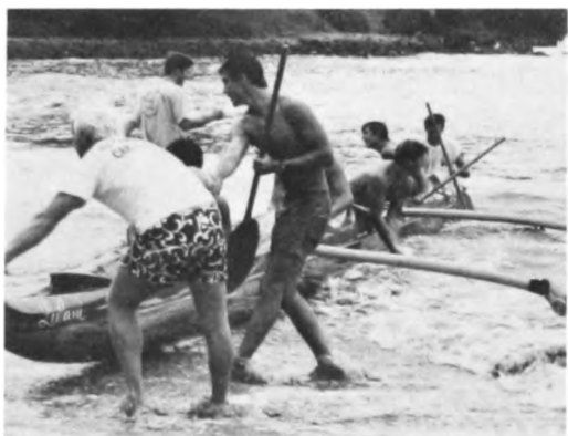
The finish at Kalapaki Beach 1 hour 40 Minutes later.