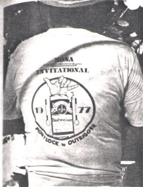
Bill Cook models Rosa T-shirt