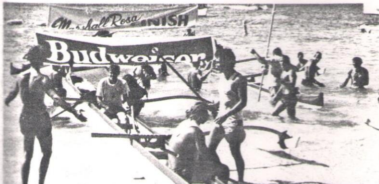
Da kine finish