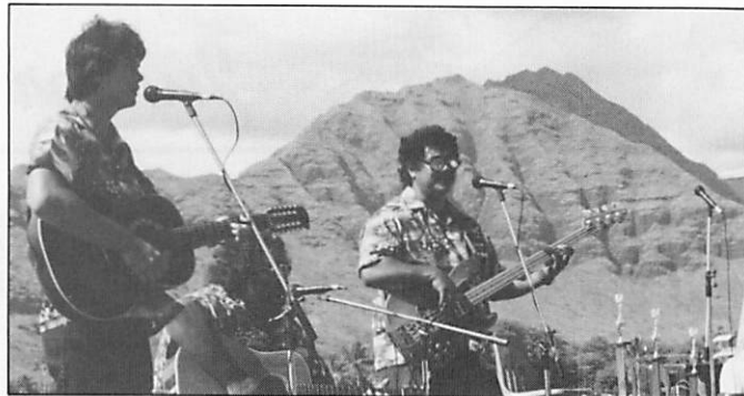
Entertainment was provided by Three Scoops of Aloha before the awards ceremony.