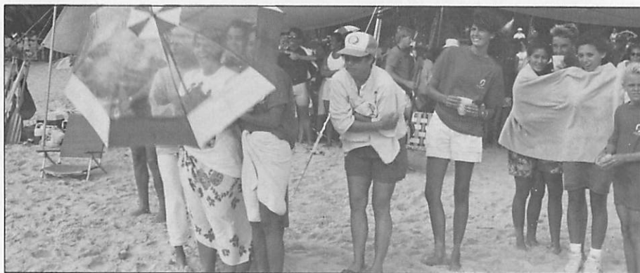
Heavy rains early in the morning didn't deter Outrigger paddlers from winning the Pops Waialeale Regatta at Waimanalo.