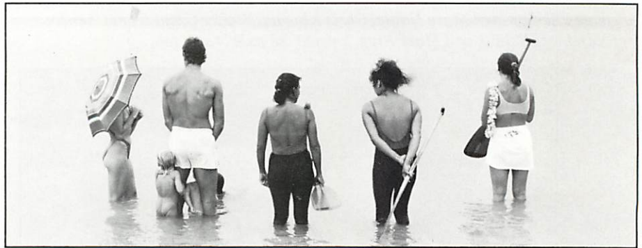
The weather was dismal at Kaneohe while paddlers waited their turn.