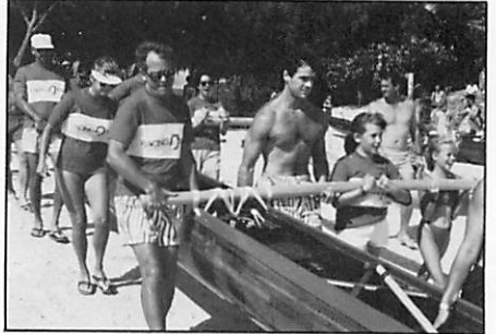
Paddlers carry the Leilani down to the beach for the regatta.