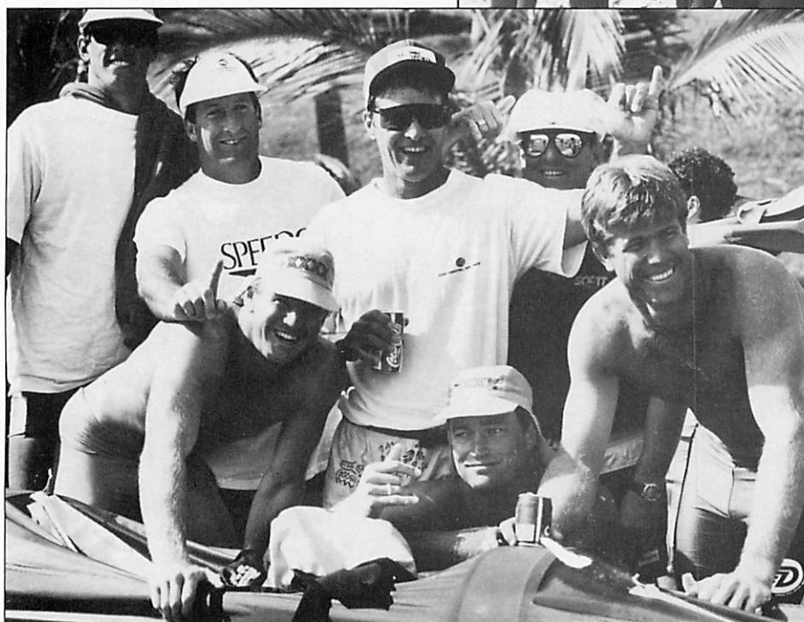
Seas were rough in the Hamilton Cup race.