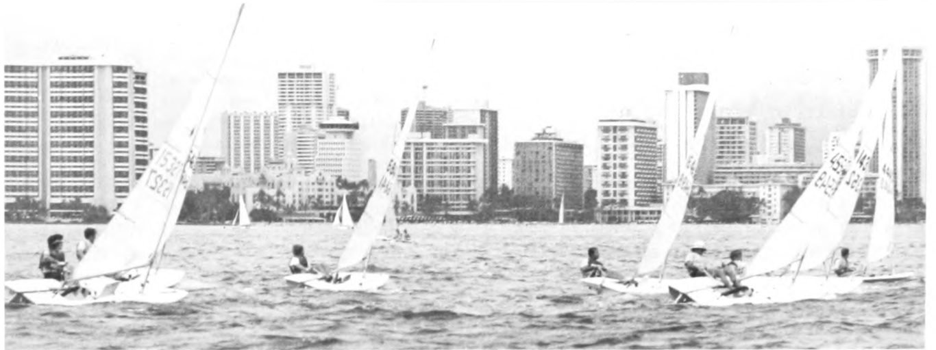
Sailor's-eye view of modern Waikiki from offshore.