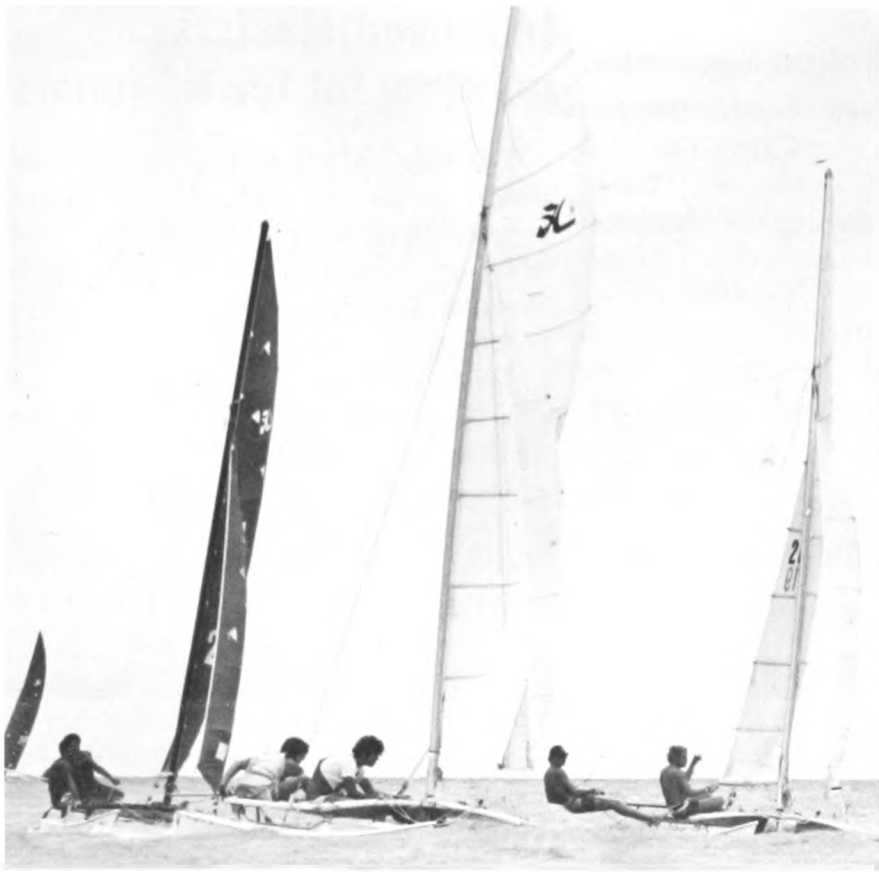
A school of Hobiecats somewhere off Oahu