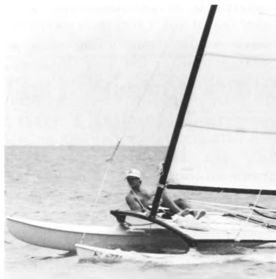
Skipper Dale Hope

There were 60 entries; 54 actually sailed. Three races for six of seven classes; only five races for the Lasers. Classboats entered included Hobie 14s & 16s, Cal 20s, Nacras, Rhodes 19s, Prindles and Lasers.