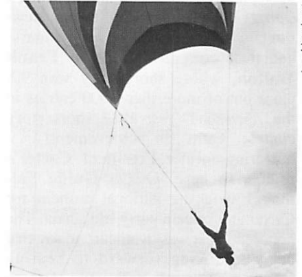
Great Fun crewman Rhett Jeffries goes spinnaker flying okole-up!

Note: A new OCC Sailing T-shirt is now on sale at our Beach Shop commemorating Transpac '83 Great Fun.