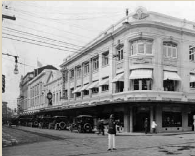
The Wichman clock can be seen in its original location on Fort Street in downtown Honolulu.