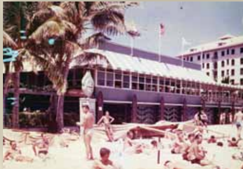
When the Club was rebuilt the clock was still prominent.