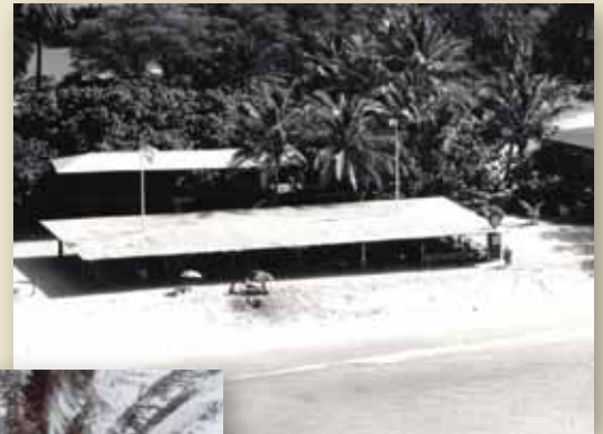
The clock was moved to OCC in 1916.