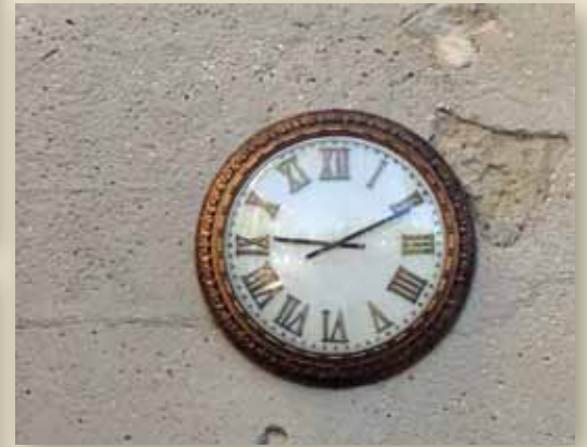
The clock moved to the new Club at Diamond Head in 1964 but this is all that is left of the once grand clock. It's now mounted over the beach stairs to the locker rooms.

chronicled the 1930 demolition of the Moana Hotel Pier.