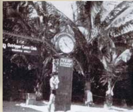
The clock faced the ocean and was visible to surfers and swimmers.