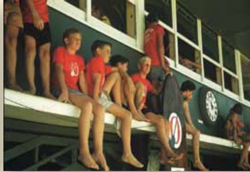
Watching the races at the old Club.