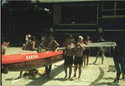
The gremmies carry the Kakina to the water.