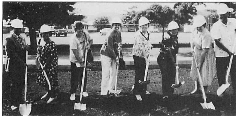
HCRA officials participated in the groundbreaking ceremony.

watch the races. The mounds will be 10-12 feet above the beach level and will make it easier to watch the races.