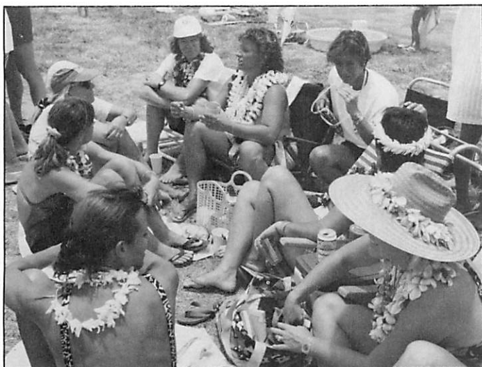
Sharing 'after the race' stories were the novice women.